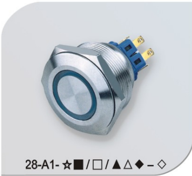
28-A1- ☆ ■ / □ / ▲ ▲ ◆ - ◇

安装孔尺寸 Mounting hole size: \Phi 28\text{mm} 开关额定值 Switch rating: 5A/250VAC 开关组合 Switch combination: 1NO1NC/2NO2NC 操作类型 Operation types: 自复式 Resettable 自锁式 Self-locking 头部形状 Head shape: 平形 Flat 带灯方式 Lamp type: 环形带灯 Ring Illuminated 外壳材料: 黄铜镀镍/不锈钢 Enclosure material: Nickel plated brass/Stainless steel 防护等级 Degree of protection: IP67, IK10