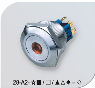
28-A2- ☆ ■ / □ / ▲ ▲ ◆ - ◇

安装孔尺寸 Mounting hole size: \Phi 28\text{mm} 开关额定值 Switch rating: 5A/250VAC 开关组合 Switch combination: 1NO1NC/2NO2NC 操作类型 Operation types: 自复式 Resettable 自锁式 Self-locking 头部形状 Head shape: 平形 Flat 带灯方式 Lamp type: 单点带灯 Dot Illuminated 外壳材料: 黄铜镀镍/不锈钢 Enclosure material: Nickel plated brass/Stainless steel 防护等级 Degree of protection: IP67, IK10