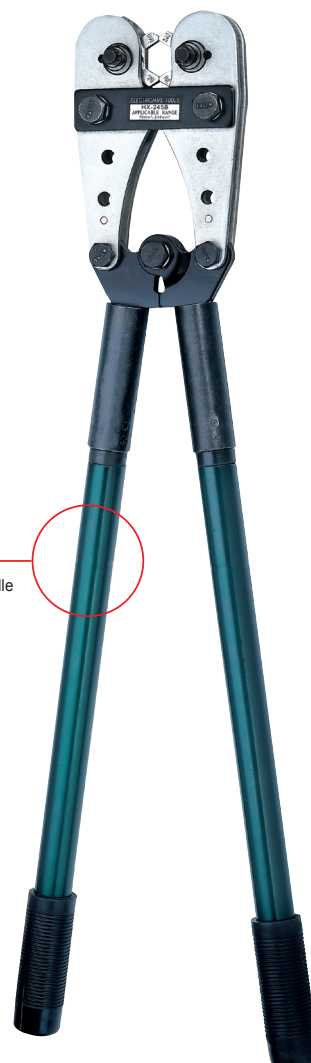
可伸缩手柄 Adjustable handle